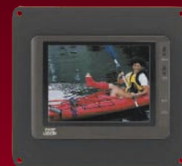
LCD-642 shown with Flush Mount Kit