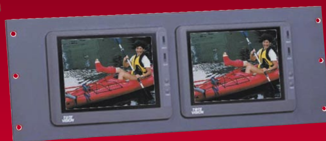
LCD-642D Dual 19" Rack Mount Unit