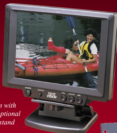
LCD-640 monitor with audio